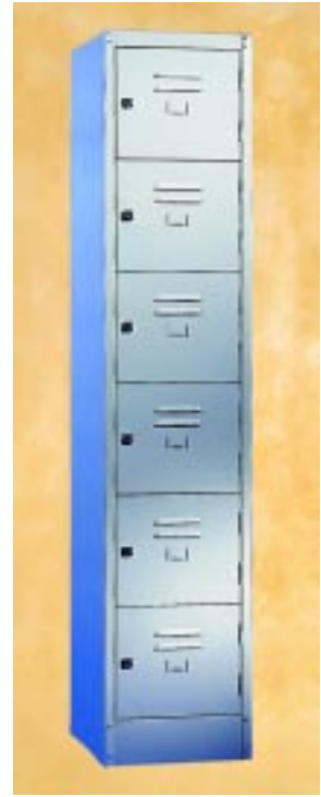
ASL - 6 Six compartment Internal dimensions H279 X W378 X D415mm