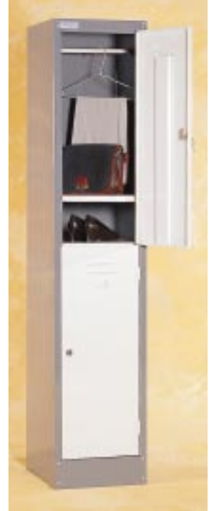
ASL - 2 Two compartment Internal dimensions H839 X W378 X D415mm