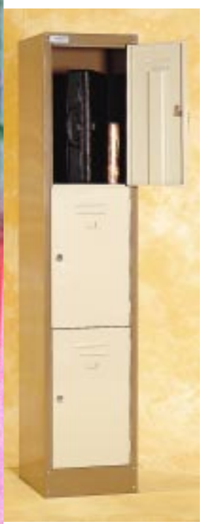
ASL - 3 Three compartment Internal dimensions H559 X W378 X D415mm