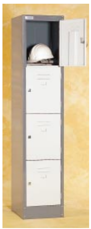
ASL - 4 Four compartment Internal dimensions H419 X W378 X D415mm