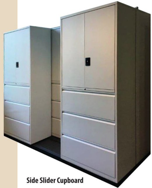
Side Slider Cupboard