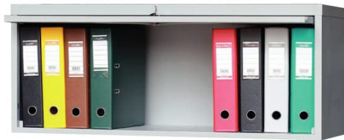
Wall Hang Cabinet