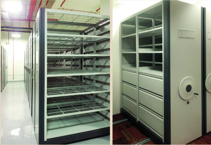
Mobile Storage System

As these products are specially manufactured to meet individual client's requirements, no stock is maintained. Therefore, a certain minimum quantity per order is required.