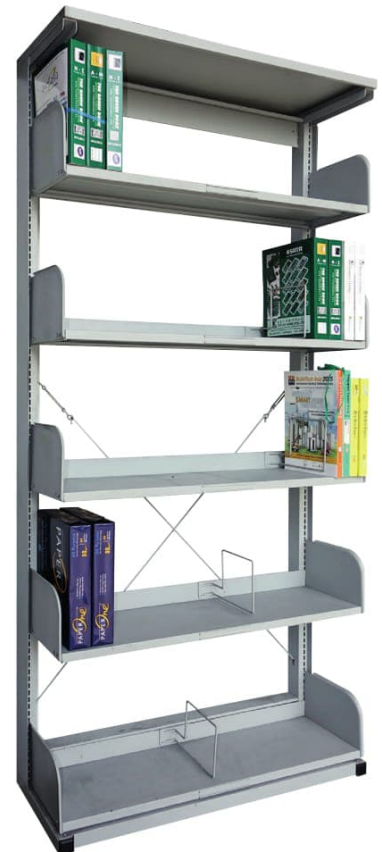
Single-Sided Library Shelving

Top-Low Height Single Tambour Door Cupboard 490H x 800W x 400mmD Bottom-Pull-Out Cabinet-Right Opening 800H x 800W x 400mmD