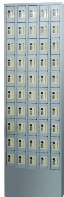
50 Compartments Handphone Locker with Clover Lock