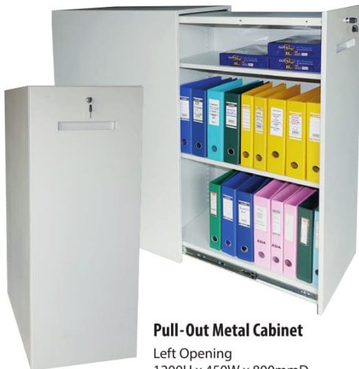
Pull-Out Metal Cabinet