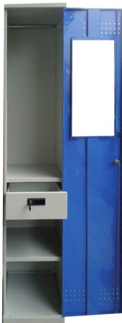
One Compartment Locker with Mirror and Drawer