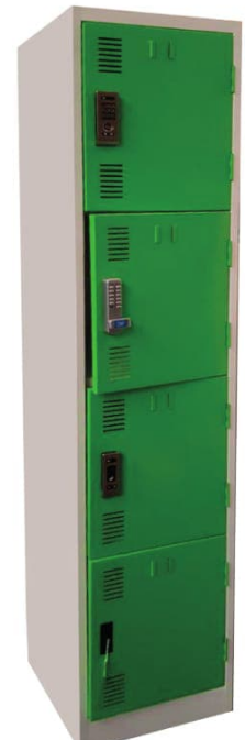
4 Compartments with Digital Lock