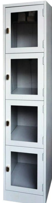
4 Compartments Locker with Acrylic Window