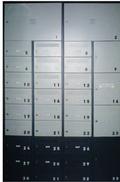
33 Compartments Combi Locker with Letter Slot