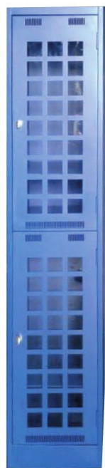
2 Compartments Locker with Square Holes Design Acrylic Window