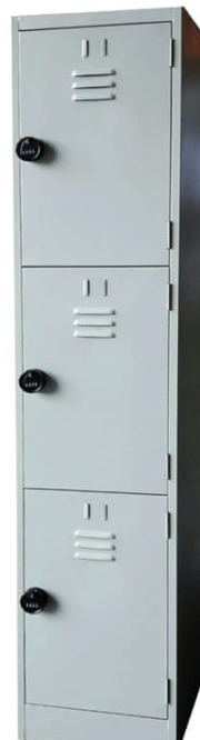
3 Compartments Locker with Combination Keyless Lock