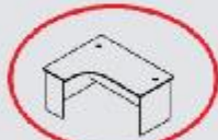
BE-LT1012-R Ergonomic Table-Right W1500 L1200 D700/450 H750