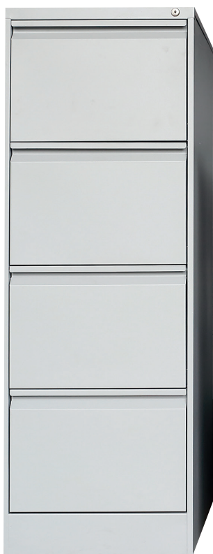
A-4D (FLRH) 1320H x 470W x 610mmD