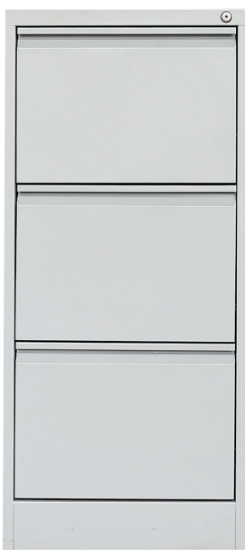
A-3D (FLRH) 1020H x 470W x 610mmD